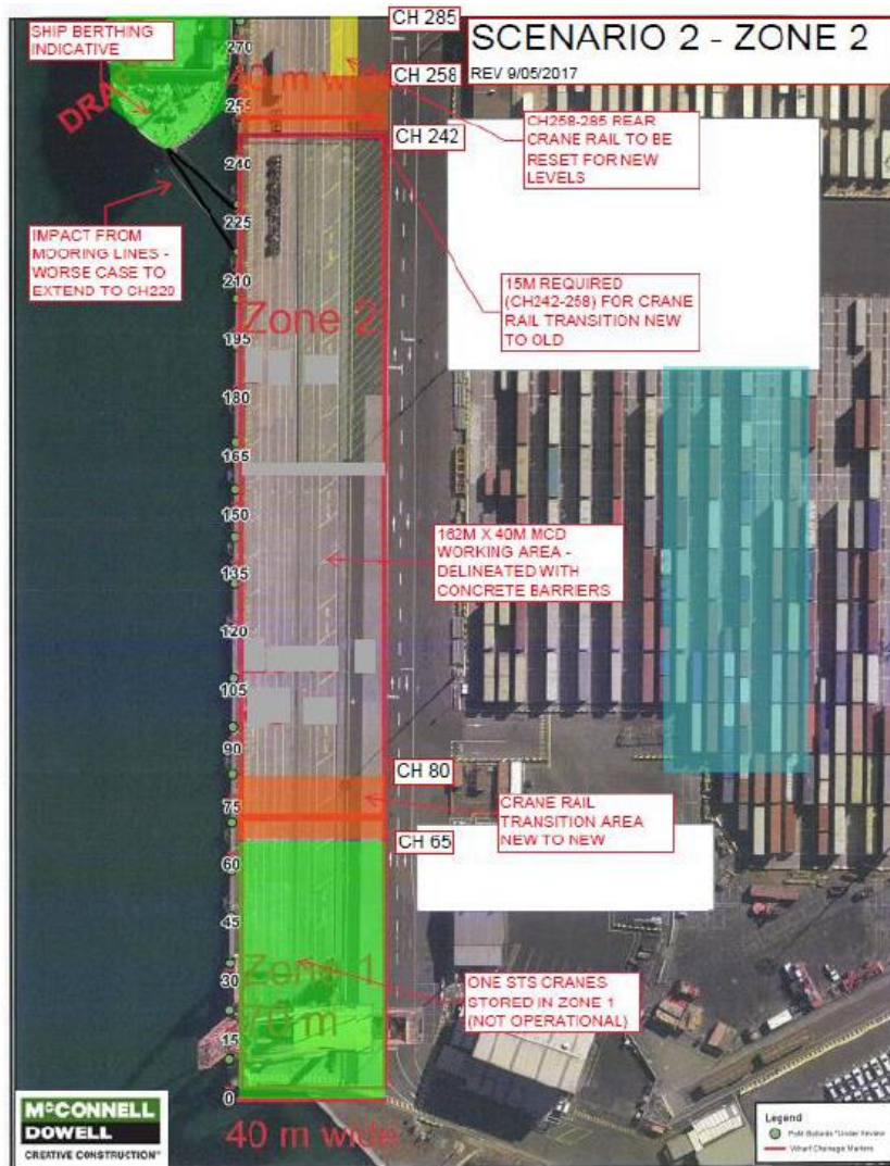
Zone 2 Construction Work Zone