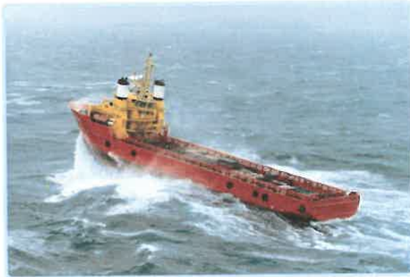
Tek Ocean Spirit (Call sign VJN4654) 87 metres