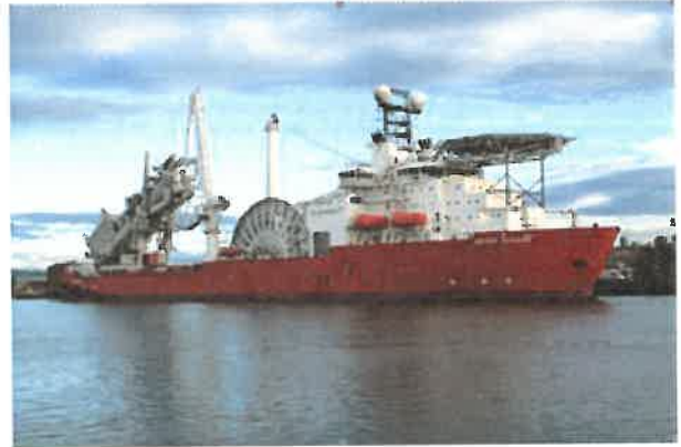
“Silver Star” (Call sign VJD 3650) 34 metres. “Seven Oceans” (Call sign MQND3) 157 metres.